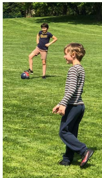
Left and below: CMI Integrated and Externée pupils enjoyed a playdate on a sunny Wednesday in April 2022. After lunch, they had fun playing at a nearby park.